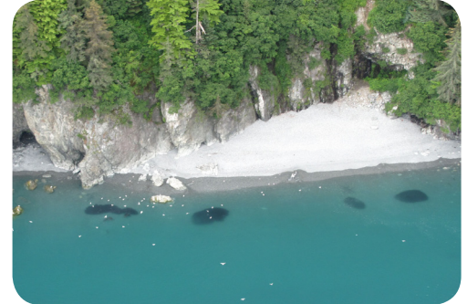
Several herring balls are easily spotted from above.

Flying 1000 feet in the air, following the contours of the Prince William Sound shoreline, schools of juvenile herring are easily identified and measured during the long summer days. Aerial surveys have been conducted in this region since the 1950s, proving to be an effective method for collecting herring population density and distribution data. Surveying from the air has the benefit of covering a large geographic area while minimizing the disturbance of herring and their predators. The small aircraft can also survey waters that are too shallow for acoustic survey vessels to access.